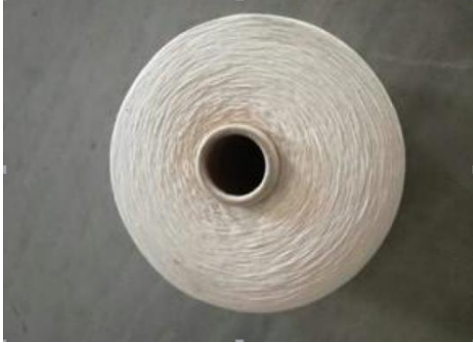
Product Photo ( 1/4 )