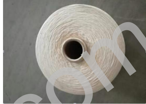
Product Photo ( 2/4 )