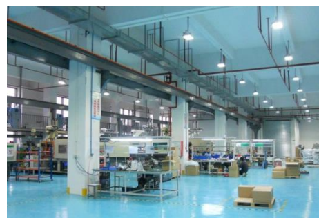
Finished Products Warehouse

Disclaimer: This report is for business decision-making reference only and shall not be used as any bases for legal actions. The contents of this report shall not be disclosed to any third Parties without the consent or authorization of Zhejiang Great Tao E-Commerce Corporation. Zhejiang Great Tao E-Commerce Corporation shall not take any responsibilities for any losses caused by using this report in any cases.