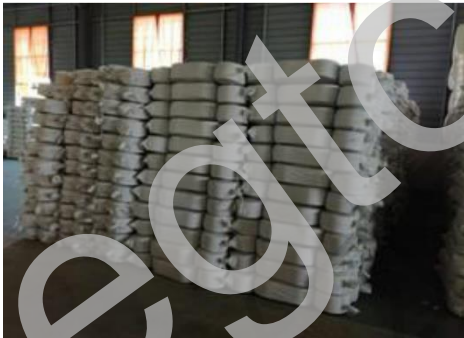
Product Photo ( 3/4 )