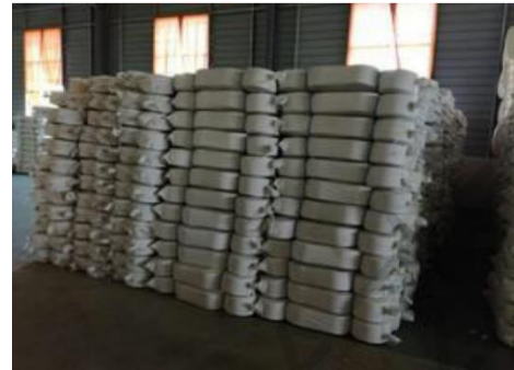
Product Photo ( 4/4 )

Disclaimer: This report is for business decision-making reference only and shall not be used as any bases for legal actions. The contents of this report shall not be disclosed to any third Parties without the consent or authorization of Zhejiang Great Tao E-Commerce Corporation. Zhejiang Great Tao E-Commerce Corporation shall not take any responsibilities for any losses caused by using this report in any cases.