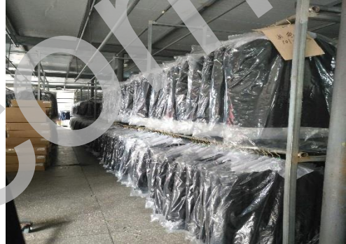
Workshop Cargoes ( 2/2 )

Disclaimer: This report is for business decision-making reference only and shall not be used as any bases for legal actions. The contents of this report shall not be disclosed to any third Parties without the consent or authorization of Zhejiang Great Tao E-Commerce Corporation. Zhejiang Great Tao E-Commerce Corporation shall not take any responsibilities for any losses caused by using this report in any cases.