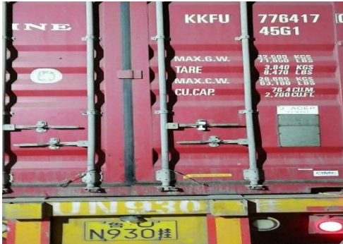
Closed Double Side Doors ( 1/2 )