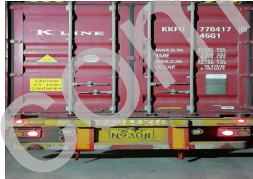
Closed Double Side Doors ( 2/2 )