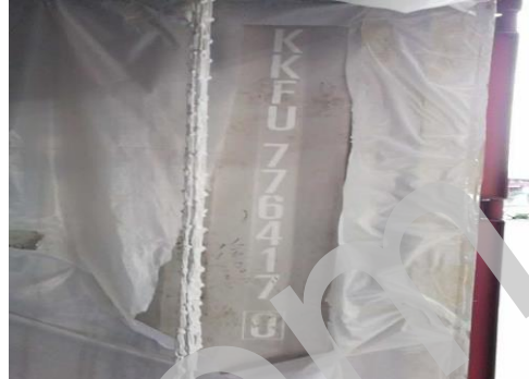
Container Interior No.