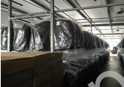
Workshop Cargoes ( 1/2 )