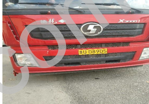
Full View of Plate No. ( 2/2 )

Disclaimer: This report is for business decision-making reference only and shall not be used as any bases for legal actions. The contents of this report shall not be disclosed to any third Parties without the consent or authorization of Zhejiang Great Tao E-Commerce Corporation. Zhejiang Great Tao E-Commerce Corporation shall not take any responsibilities for any losses caused by using this report in any cases.