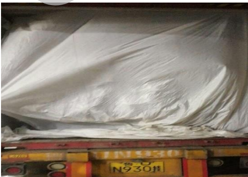
Completed Loading ( 3/3 )