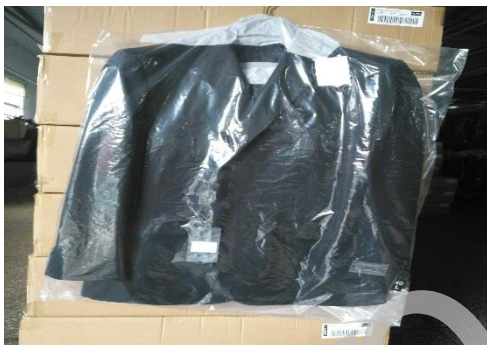
Obverse of Product ( 1/2 )