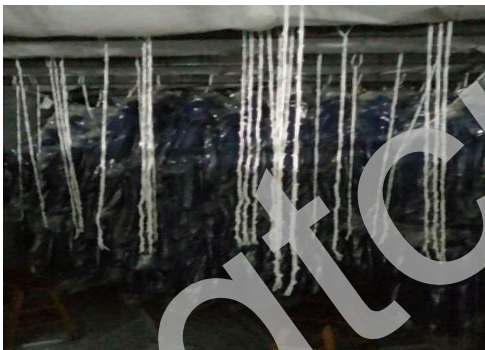
Loading Process ( 1/3 )