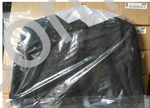
Obverse of Product ( 2/2 )

Disclaimer: This report is for business decision-making reference only and shall not be used as any bases for legal actions. The contents of this report shall not be disclosed to any third Parties without the consent or authorization of Zhejiang Great Tao E-Commerce Corporation. Zhejiang Great Tao E-Commerce Corporation shall not take any responsibilities for any losses caused by using this report in any cases.