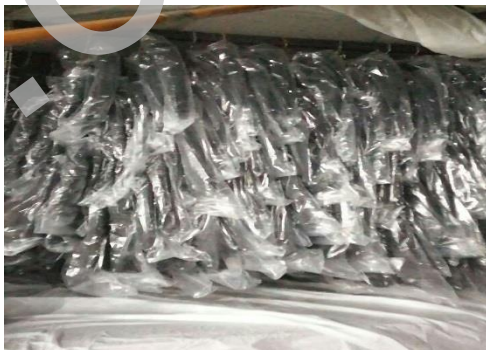
Loading Process ( 2/3 )