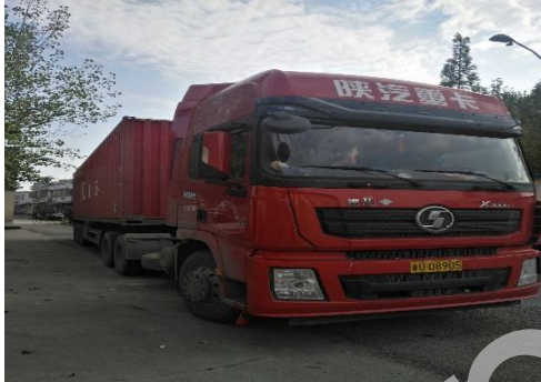
Full View of Container Truck ( 1/2 )